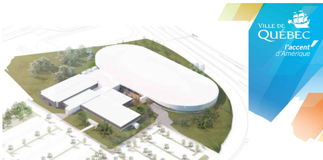
Quebec City Ice Center

Public transportation in the city : Réseau de transport de la Capitale (Buses) https://www.rtcquebec.ca/