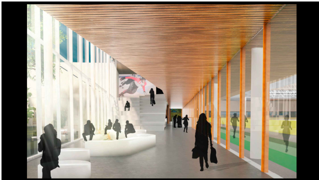
Quebec City Ice Center Main Hall, lower floor